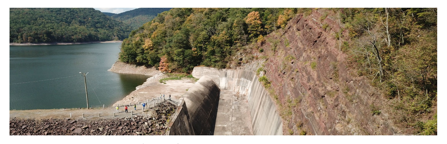
Savage River Dam, Maryland.

Remember! As you review the ways to meet plan requirements, be sure to protect all sensitive and/or personally identifiable information.