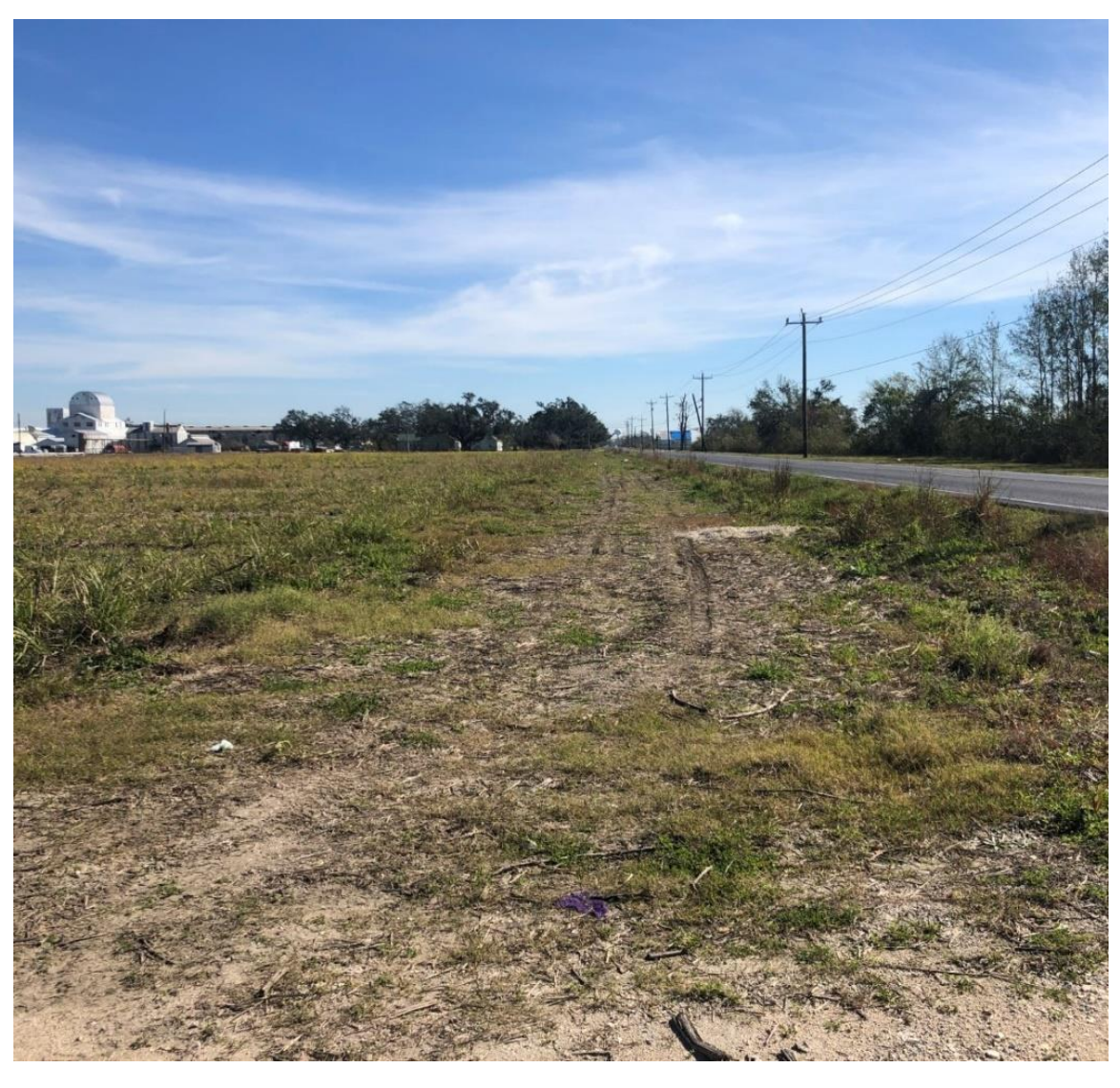
Figure 4: Photograph of Existing Site Conditions at the Proposed Valentine #3 Group Site. Photo Taken from Southwest Corner of Group Site, Facing East.