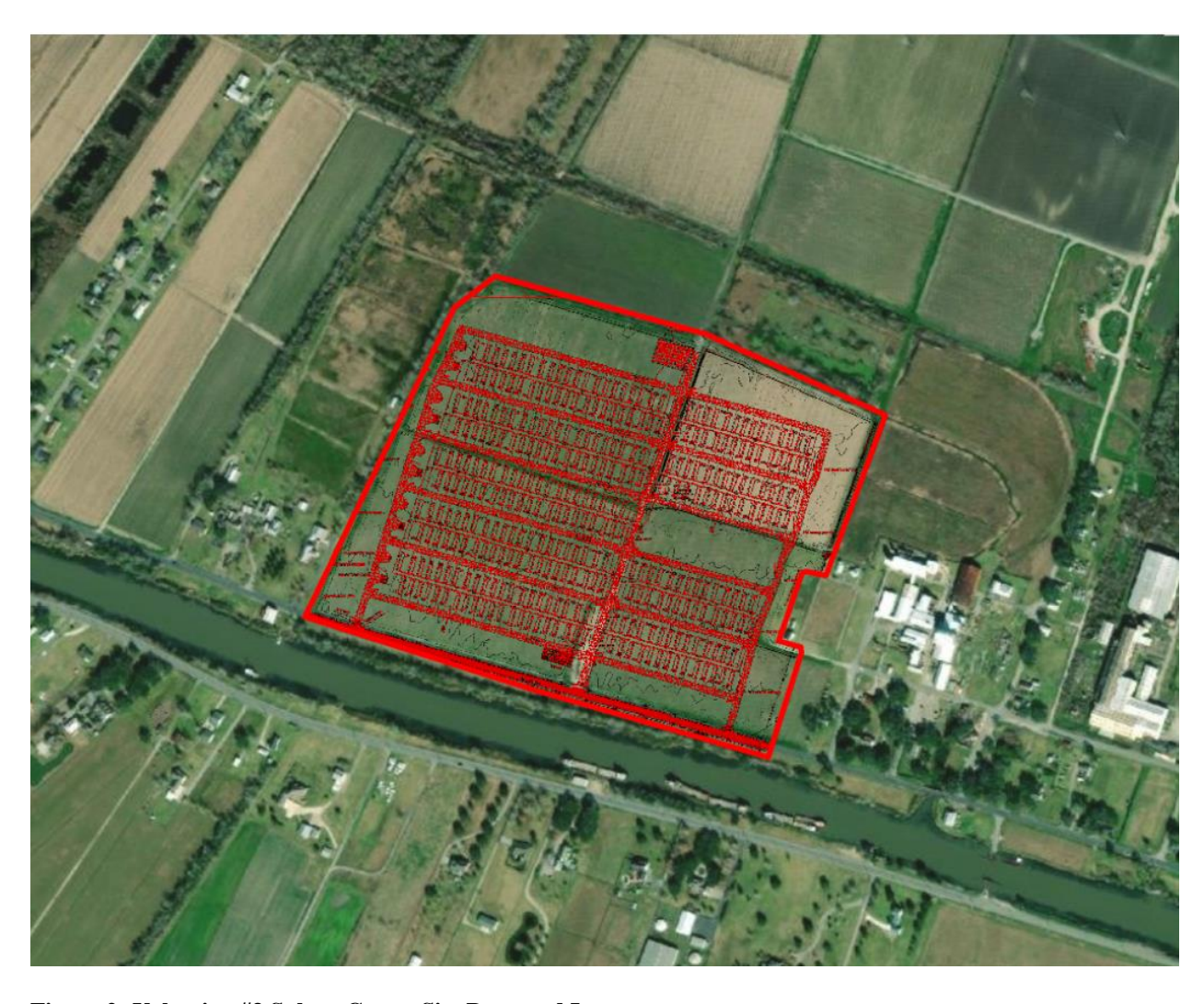
Figure 2: Valentine #3 Subset Group Site Proposed Layout