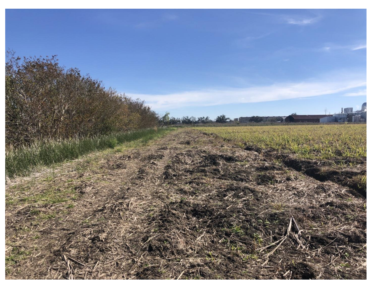
Figure 6: Photograph of Existing Site Conditions at the Proposed Valentine #3 Group Site. Photo Taken From Northwest Corner of Group Site, Facing East.