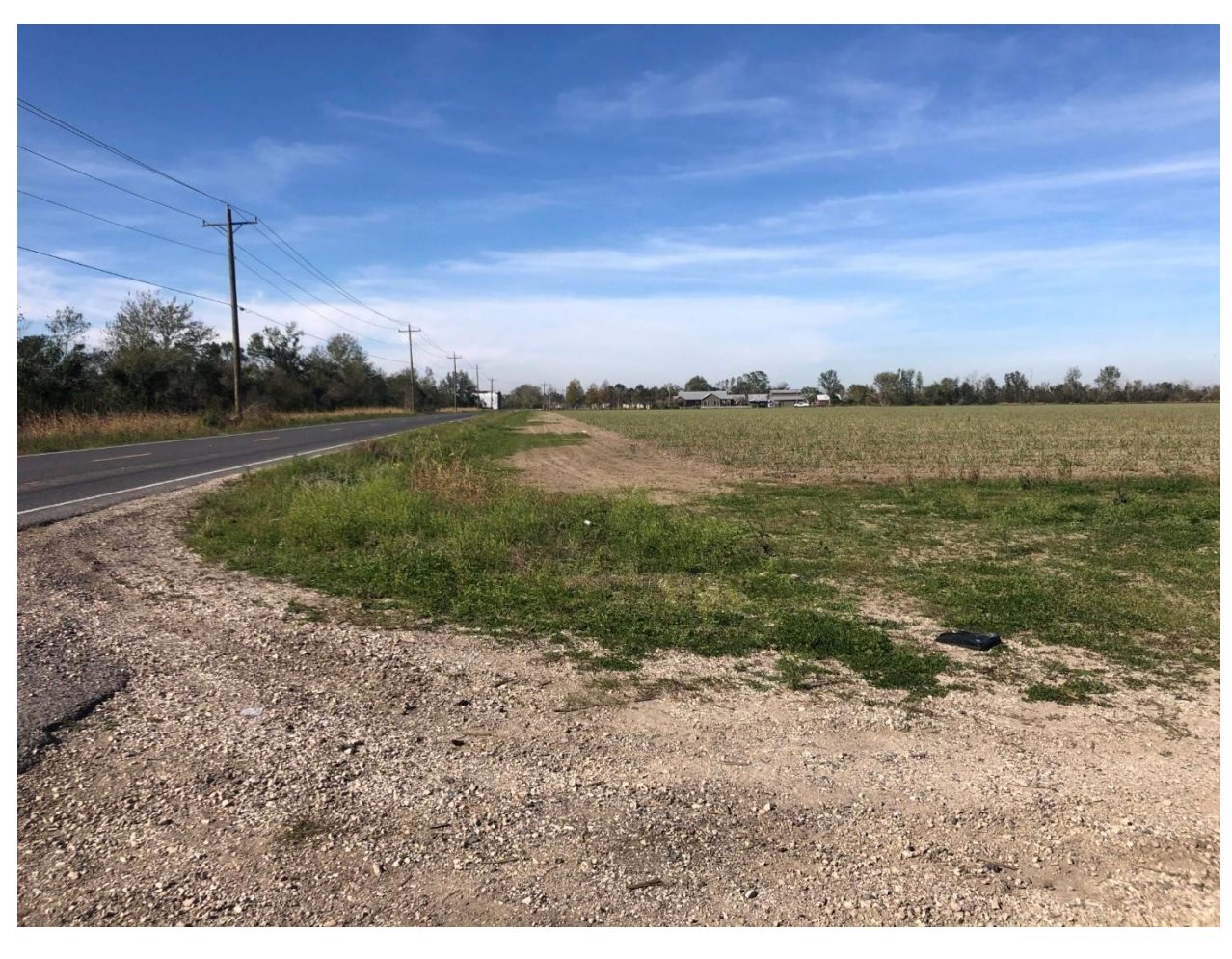
Figure 5: Photograph of Existing Site Conditions at the Proposed Valentine #3 Group Site. Photo taken from Southeast Corner of Group Site, Facing West