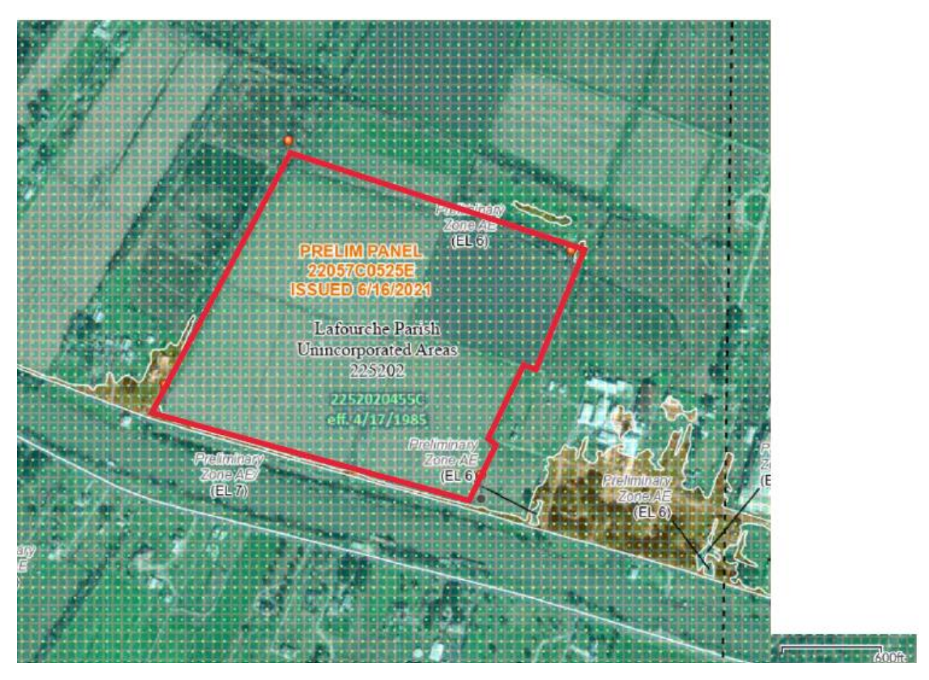
Figure 3: Flood Insurance Rate Map (FIRM) for the Proposed Valentine #3 Subset Group Site