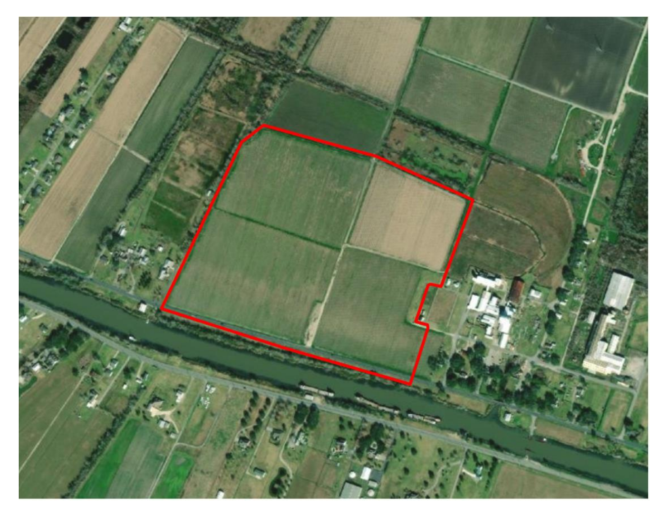
Figure 1:Aerial Photo and Vicinity of Proposed Valentine #3 Subset Group Site