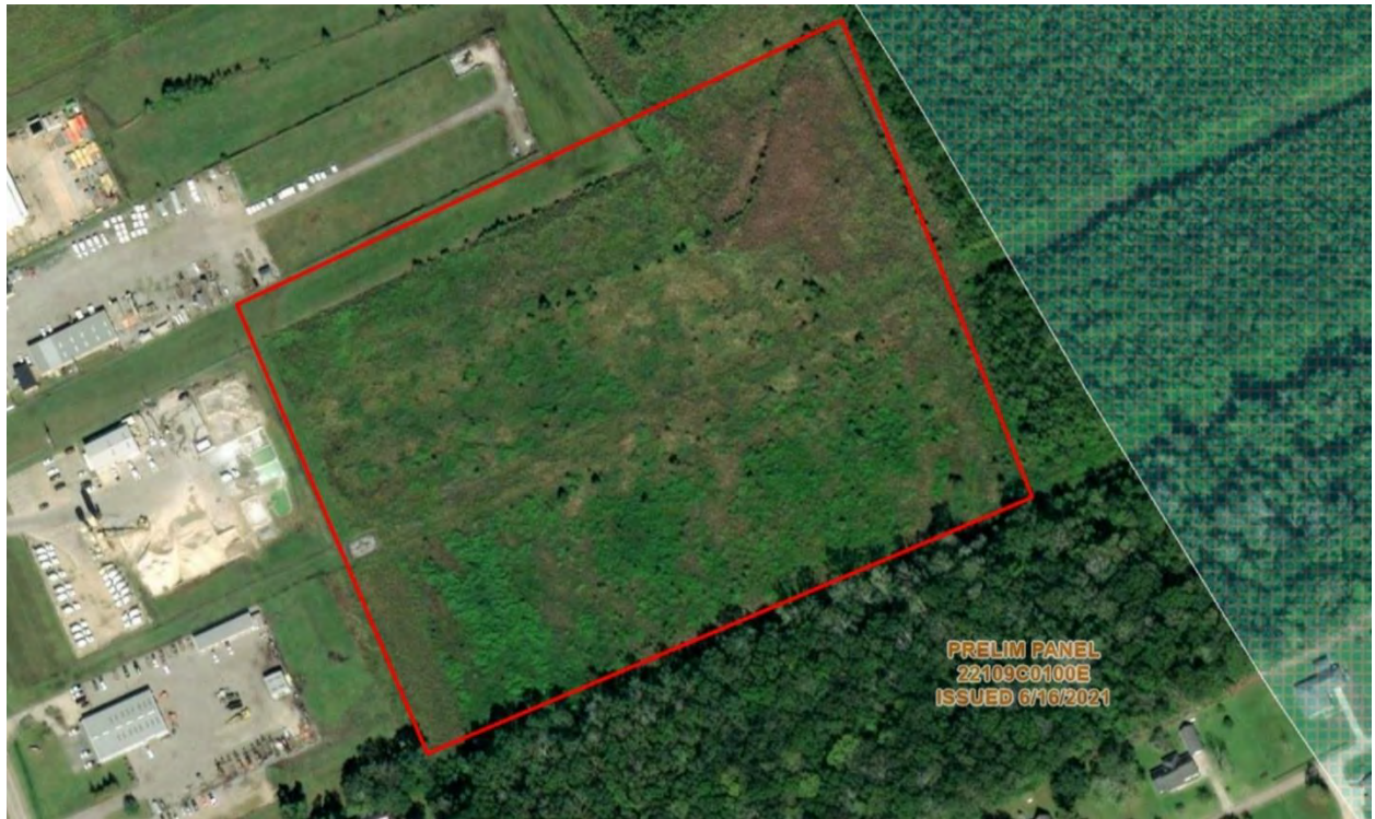
Figure 4: 2519 W Park Ave Flood Insurance Rate Map (FIRM)