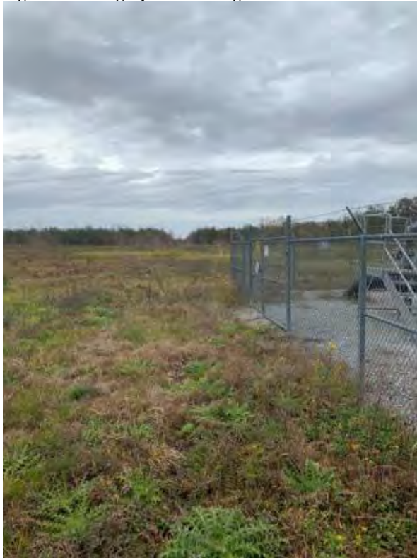
Figure 6: Photograph of Existing Site Conditions at the Proposed 2519 W Park Ave Group Site Facing East