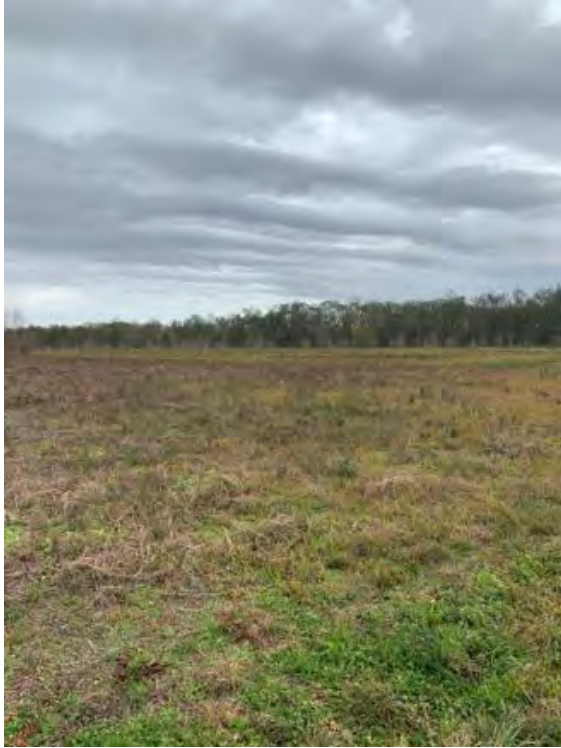
Figure 5: Photograph of Existing Site Conditions at the Proposed 2519 W Park Ave Group Site Facing Southeast