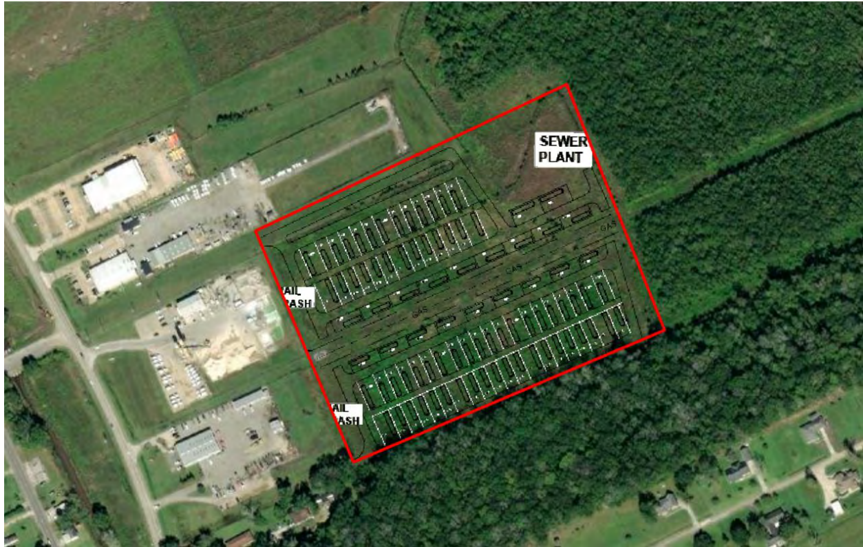
Figure 2: 2519 W Park Ave Group Site Proposed Layout