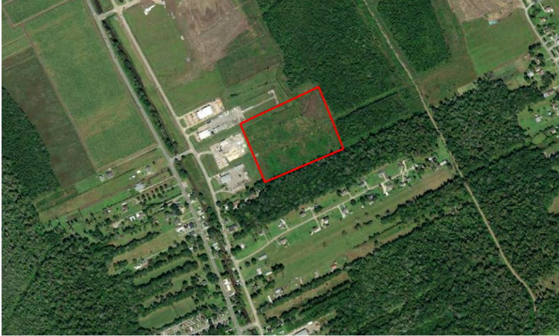
Figure 1: Aerial Photo and Vicinity of Proposed 2519 W Park Ave Group Site