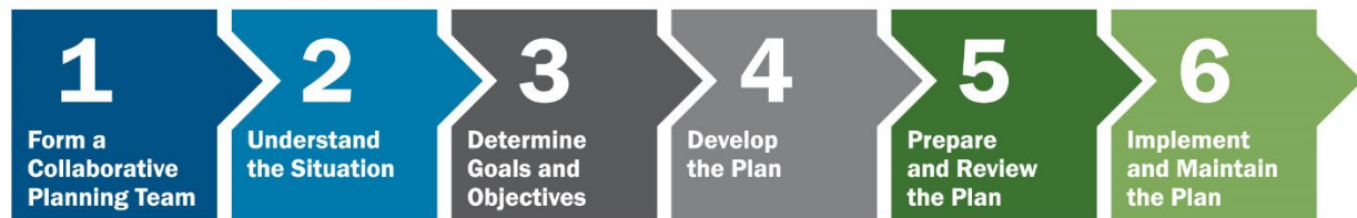
Figure 3: Six-Step Planning Process

CPG 101 provides a standardized planning process that SLTT jurisdictions can use to develop disaster housing plans that integrate and synchronize with existing operational and strategic planning products and efforts. This promotes consistency between plans and provides a familiar framework for stakeholders to engage and participate. Figure 3 depicts the Six-Step Planning Process from CPG 101.