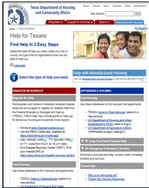
Figure 2: Screenshot of the State of Texas Housing Website

Messaging about the importance of flood insurance, homeowners and rental insurance and documentation of proof of ownership (e.g., deed, title, mortgage statement) can expedite disaster assistance. Jurisdictions and states should develop a communications strategy that includes preparedness activities and messaging in alternative formats, so everyone has access to information regarding services and assistance.