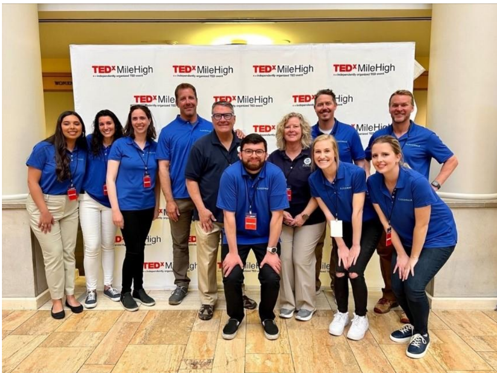
FEMA's Region 8 CERC team at TEDxMileHigh ASCEND

Team members gave out themed giveaways for people of all ages, such as reusable straws, rubber ducks and the My Rain Garden educational coloring book. The event was a great success with the audience. It led to a better understanding of local concerns and what mitigation measures people can take in their homes.