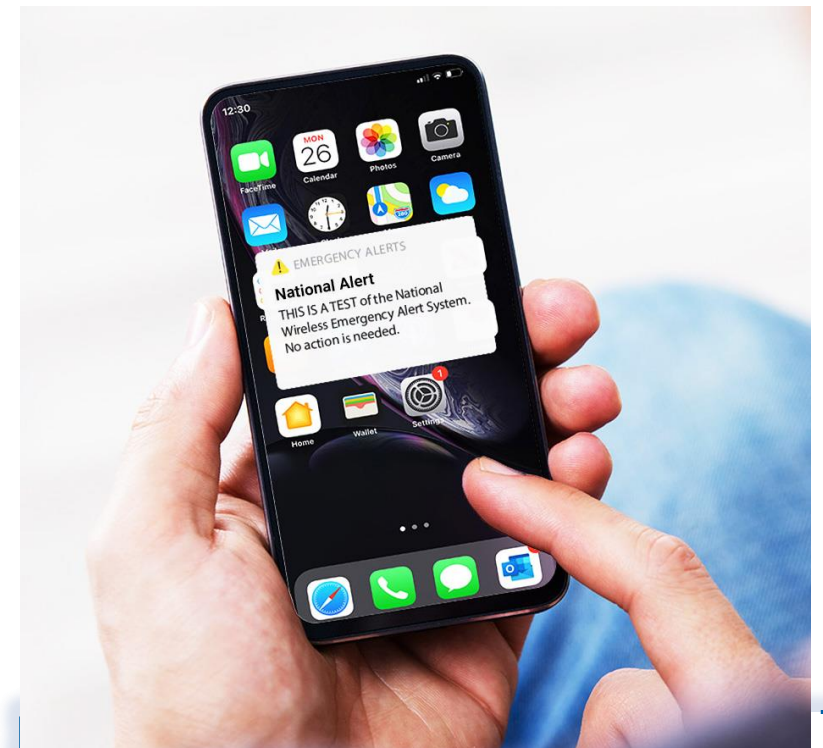
The graphic above shows the IPAWS National Test on a phone