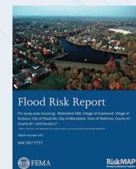
Flood Risk Report