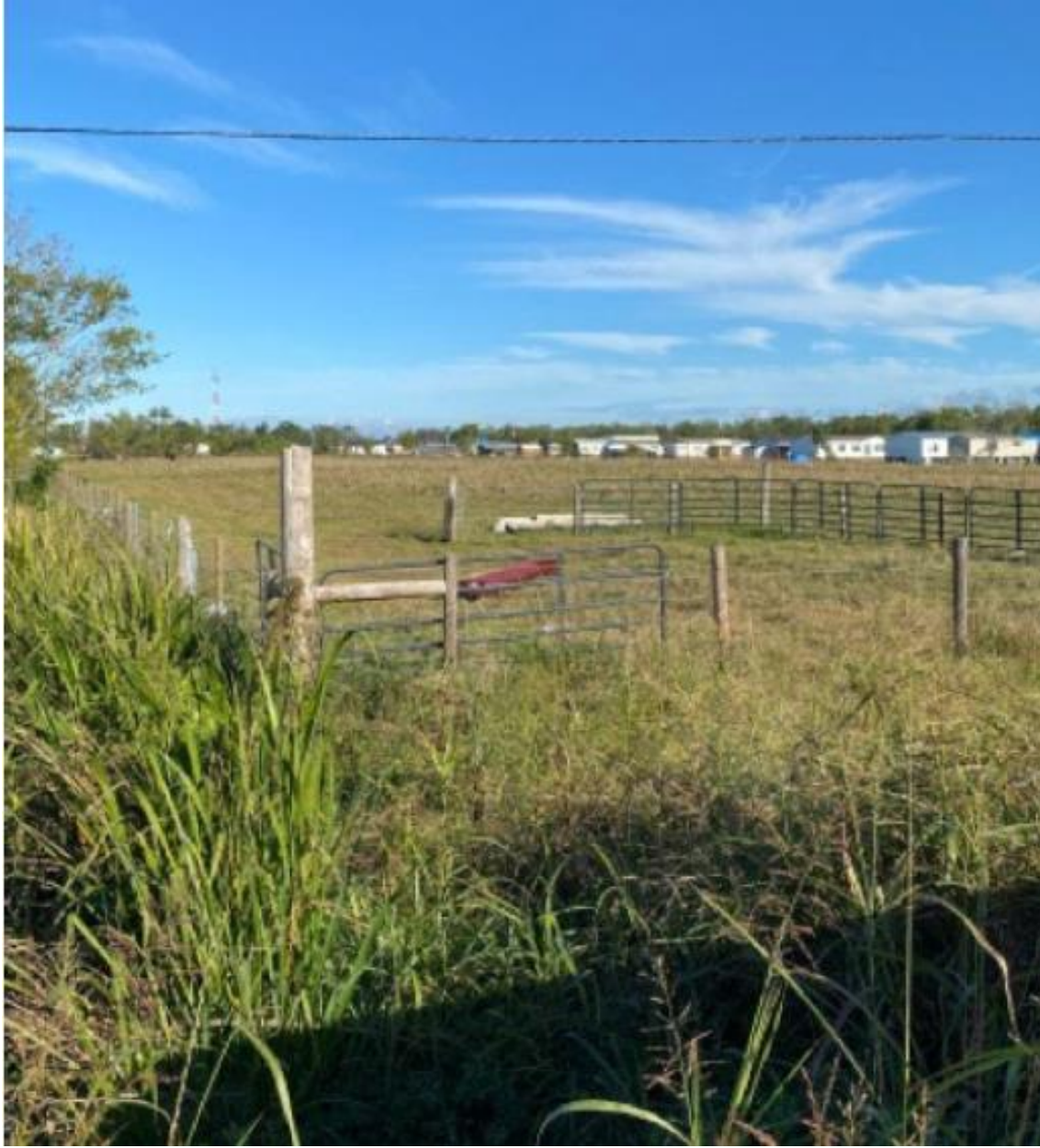
Figure 5: Photograph of Existing Site Conditions at the Proposed Triche Group Site Facing Southeast