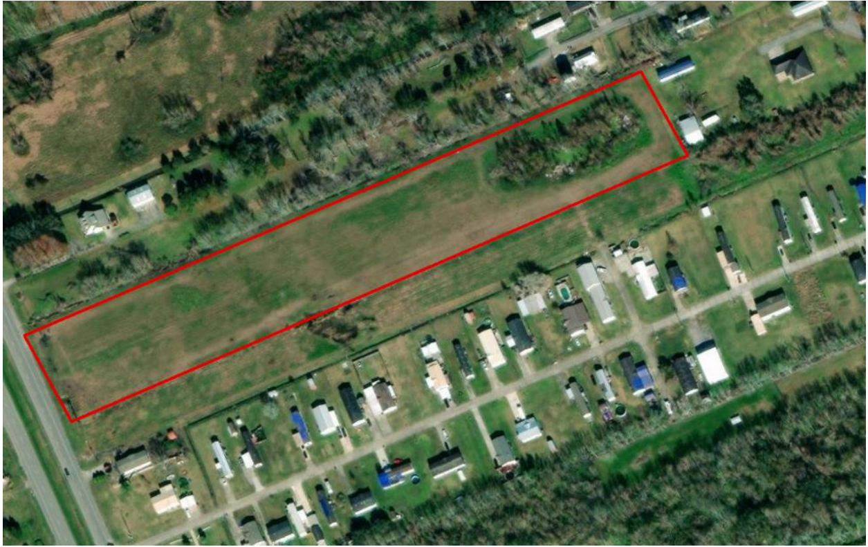
Figure 1: Aerial Photo and Vicinity of Proposed Triche Group Site