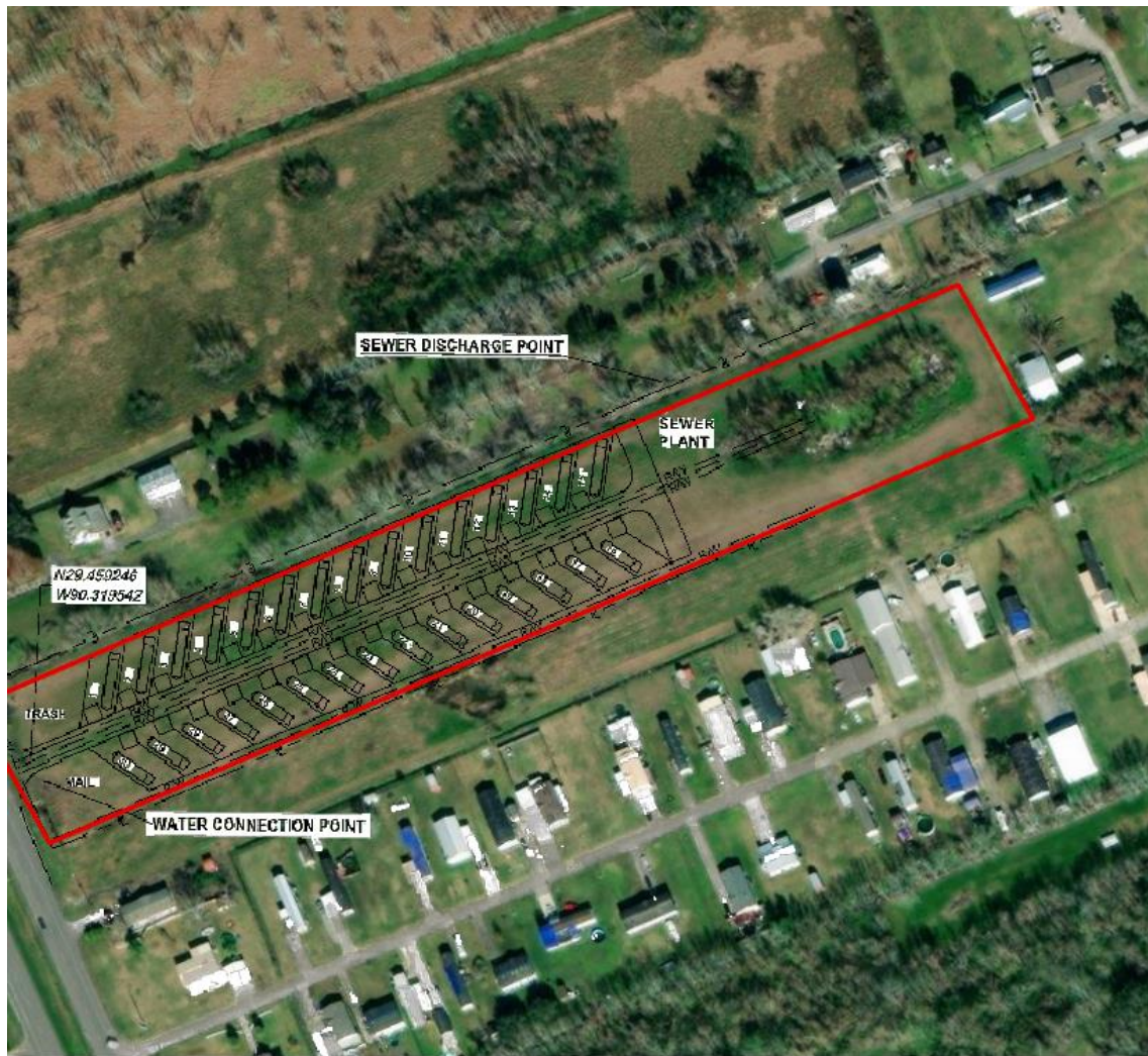
Figure 2: Triche Group Site Proposed Layout