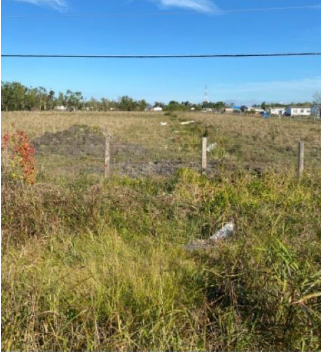
Figure 4: Photograph of Existing Site Conditions at the Proposed Triche Group Site Facing East