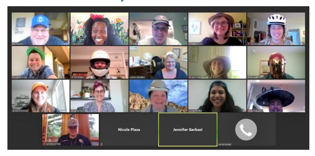
Figure 2. To build morale over the new virtual platform, FEMA encouraged all ESWG members to wear their favorite hats during the Q2 meeting