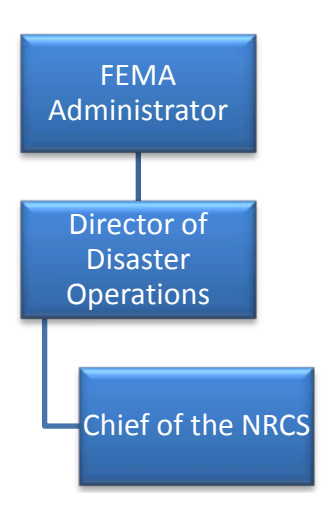
Figure 4. National organizational structure

At FEMA Headquarters, many organizational elements and individuals play key roles in incident support. The FEMA Administrator, the Director of Disaster Operations (DDO), the National Watch Center, and the National Response Coordination Staff (NRCS) have lead roles and responsibilities, described in the following section.